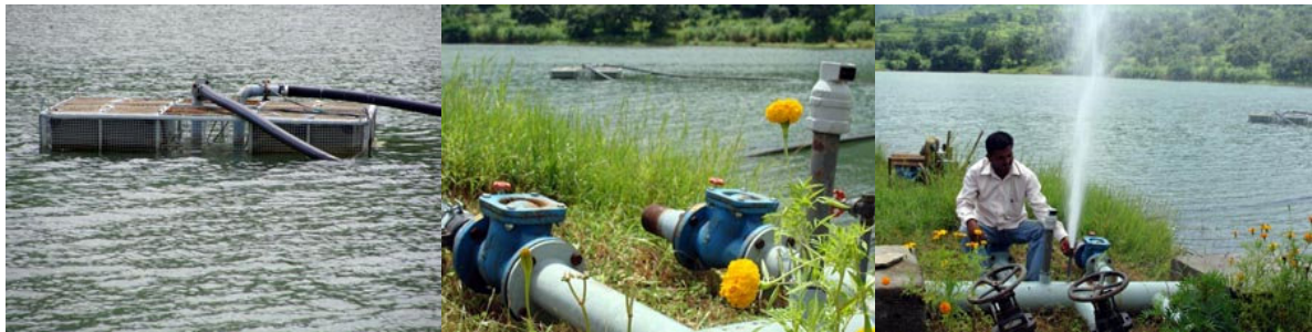
Lift irrigation site at Khatarkhadak. Photo 1: Submersible motor pumps water; Photo 2: Pipeline system-feeder pipes carry water to the farms; Photo 3: Tanaji testing the water pressure in the pipe.

But this year the story has been a little different. In quite a few fields, a second crop has been harvested, and the tide of unprofitability in farming appears to be ebbing. The reason for this new change is the lift irrigation system that has been set up in the Katarkhadak and Khamboli villages under the JICA supported project by ICA. This is bringing waters to the fields of the farmers and is keeping them busy for two seasons in a year.